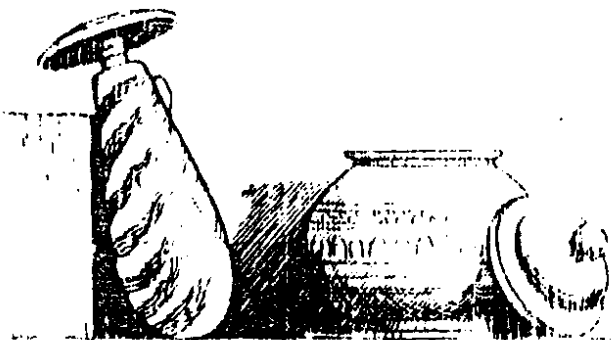
Toropii kaliangan pakakas men niwawau na watu pualam

3 Sarataa ai Yesus na Betania, na laigan ni Simon men kustaon mbaripi, taka a wiwine sa'angu' nanga-wawa botor men watu pualam, buke' a minamina' narwastu. Minamina' narwastu iya'a alayo' tuu' a angga'na gause sianta baurna. Kaekae' kumaan i Yesus, ia pula'imo wiwine iya'a a talopna botorna, kasi nitim-